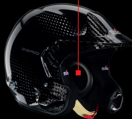
Optional short visor